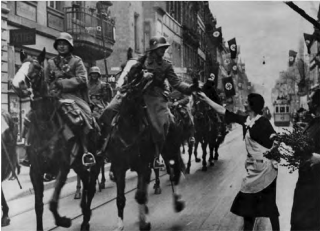
A photograph of German troops riding into the Rhineland on 7 March 1936.