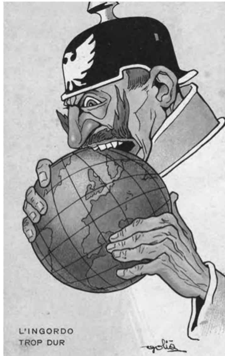
A French postcard published at the beginning of the war. The caption reads 'The glutton – too hard'. A glutton is someone who eats too much.