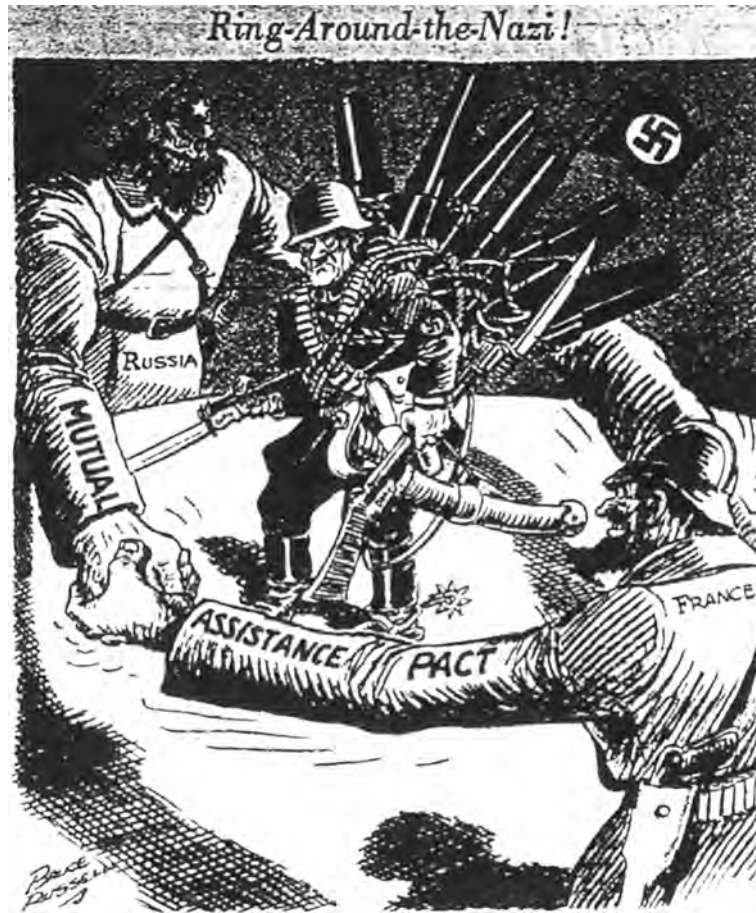
An American cartoon published in March 1936.