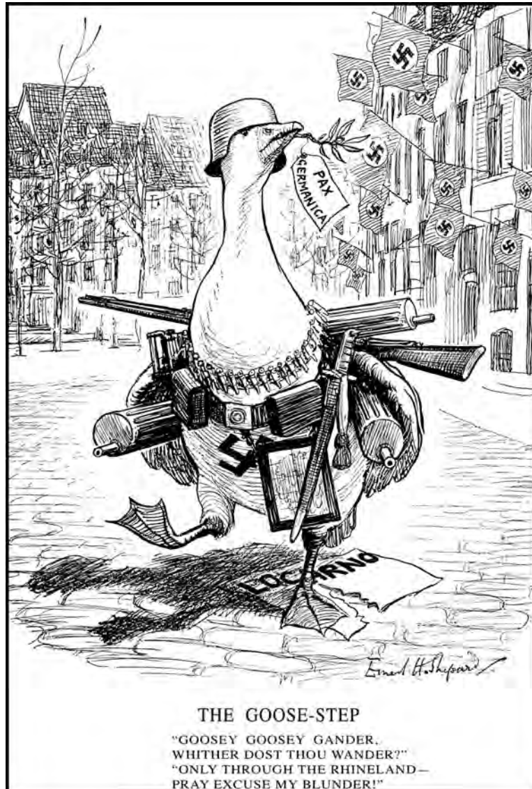
A British cartoon, March 1936. 'Pax Germanica' means 'German peace'.