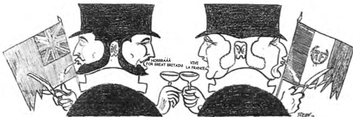
A cartoon published in Germany in 1903. The title of the cartoon is 'See the French-English alliance'.